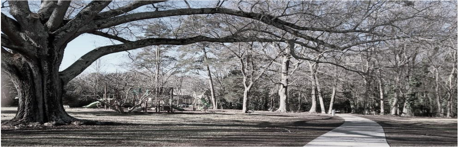
A new, wide sidewalk at Cedarwood Park has replaced the gravel trail that looped around the playground.